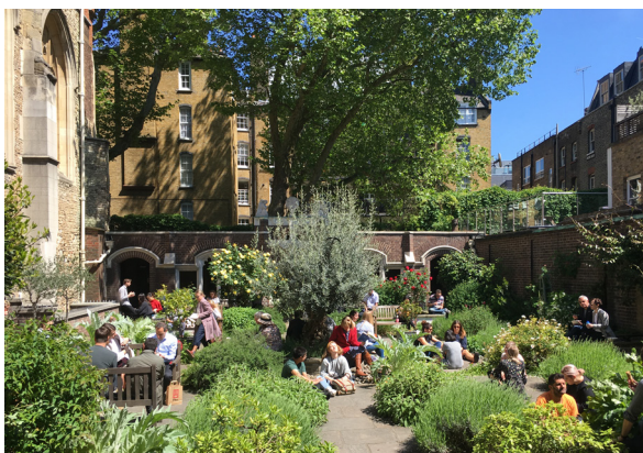
Lunchtime in the Cloister Garden at the Museum of the Order of Saint John, Clerkenwell.