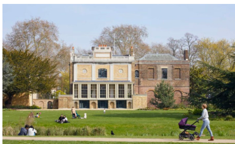
Walpole Park in Ealing is one of the many listings on our www.GoParks.London site.