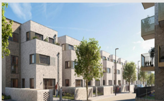
The Assembly: a high density, car-free development planned in Hounslow.

Too much new housing is 'car dependent' – but London is leading the way with 'car-free' housing. In our towns and cities between a third and half of households don't have access to a car, often the young and old and people on low incomes. So building housing where you don't have to use a car to get to local shops, schools or doctors benefits many people.