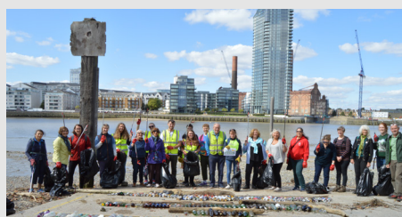
Thames Path Green Clean

Overall, we collected 739 drinks containers of all shapes, sizes and materials demonstrating the need for an 'all-in' deposit return scheme to tackle litter and encourage recycling. We were delighted to see provision for such a scheme included in the Environment Bill.