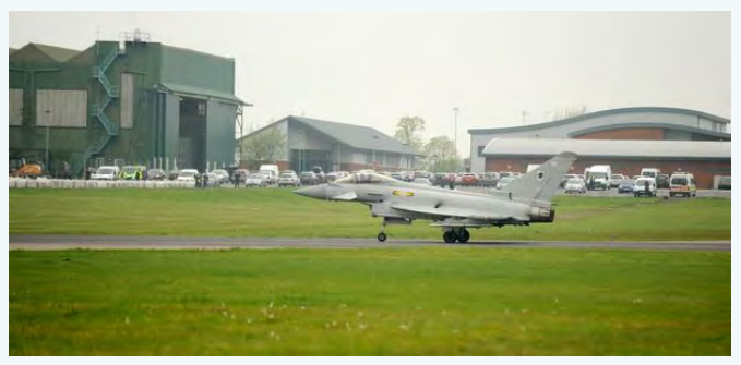
RAF Northolt: Ealing Council is proposing the redevelopment of the site for up to 40,000 new homes.

As CPRE has shown in 'Removing Obstacles to Brownfield Development', brownfield land is "a renewable and constantly changing resource". The supply of brownfield land is not limited: more comes on stream each year as the use of urban land and buildings change. In this way it can be seen as a renewable resource. Newly identified brownfield land will create space for more housing in London in years to come. For example, Ealing Council has recently proposed that RAF Northolt, which is not protected land, is redeveloped as a garden suburb with potential for 20,000 homes. According to the Mayor of London's website, London currently has enough major brownfield sites, or 'Opportunity Areas', for at least 302,300 new homes. We can be sure that this is just a snapshot in time and that new brownfield land will emerge to replace that which is redeveloped.