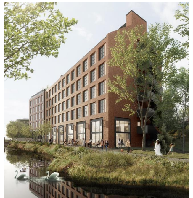
Co-living scheme on the Wandle

Wandsworth. Sadiq Khan has said he has serious concerns about the level of affordable housing of the Alton Estate in Roehampton. Residents are concerned about the loss of trees and damage to the character of the area Gū (2). A 292-room co-living scheme on the banks of the River Wandle has been approved bd.