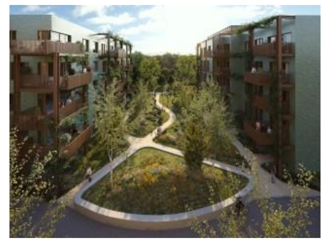
Inland Homes plans for Hillingdon Gardens

Hillingdon . Brownfield land developer Inland Homes has submitted a planning application to develop a sixacre site next to Hillingdon tube station in west London for more than 500 homes, 36% affordable. The company says that it has been working with the London Wildlife Trust to protect the existing eco systems and enhance biodiversity throughout the scheme, which includes a network of footpaths, public squares and green spaces