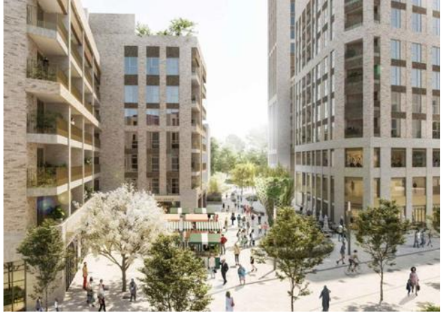
Plans for South Kilburn

Brent . New plans have been submitted for a high density development in South Kilburn, increasing the number of dwellings from 226 to 308 and boosting the level of affordable housing to 40% bd .