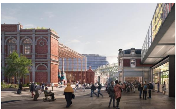
Plans for the Museum of London

City. Foster & Partners have launched an appeal over the rejection of its plans for the controversial 305m high Tulip tourist attraction bd. Plans have been submitted for the new Museum of London scheme, now costed at £337m, at West Smithfield bd. Architects have been appointed to repurpose Smithfield Market and improve the public realm bd ling.