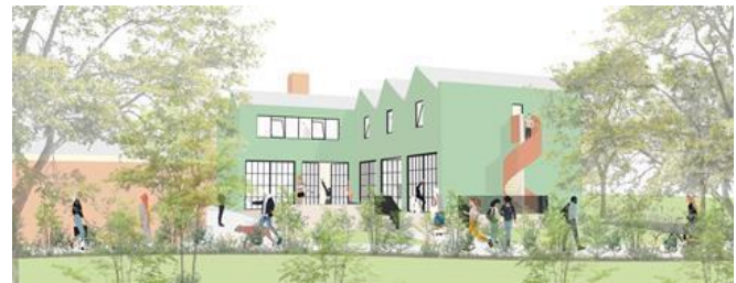
Harrow Arts Centre

Harrow. Architects have been appointed for the new Harrow Arts Centre bd .