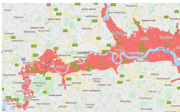
Coastal flood risk 2050