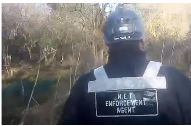
Bailiffs at Hillingdon Outdoor Activity Centre

In the courts. HS2 Ltd wants to erect fencing and an earth embankment in a field near South Harefield to enable a population of newts to be moved out of the way of the proposed viaduct. Hillingdon borough refused approval on the basis that the design and external appearance of the works should be modified to preserve a site of archaeological interest and nature conservation value. It said the development could reasonably be carried out elsewhere. A planning inspector agreed but the secretaries of state approved the scheme. Now the high court has ruled in favour of HS2 and ministers. Hillingdon challenged on the grounds of damage to archaeology but the judge ruled against the borough [200] In A Park Village East resident has been granted permission to bring legal proceedings against HS2 Ltd for its Euston tunnel design, claiming that it will "endanger the lives and properties of residents nearby" if a retaining wall at Mornington Crescent collapsed we High light HS2, which argued that protesters were occupying a pathway at a construction site in Hillingdon illegally, won a possession order at the high court and evicted the protesters Rut new protesters soon returned Rut new protesters soon returned Rut new protesters soon returned Rut new protesters soon returned Rut new protesters soon returned