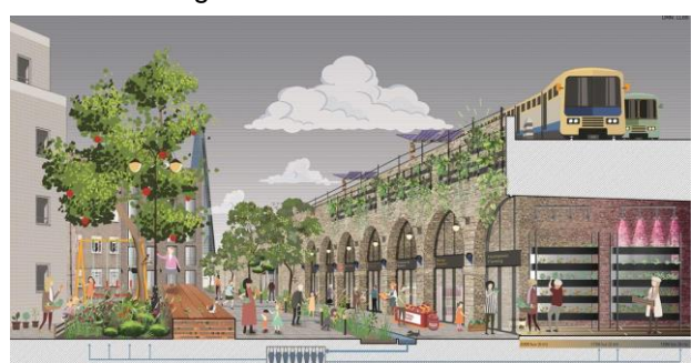
Winning design for the Low Line

Protecting green spaces. The Union of Hackney Gardens said it was alarmed at the lack of a community designation policy to protect open spaces in the emerging local plan emerging local plan a majority of three to two, the supreme court refused town green status for school playing fields in Lancashire and NHS land at Leatherhead in Surrey. The essence of the judgement that if land is held for statutory purposes, it cannot be registered as a town green. It is probable that this judgement also applies to the registration of rights of way g 🎉 🐞 th. PDP London has won an international design competition to create a green strategy for the Low Line walking route in Southwark bd.