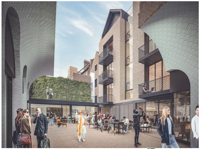
Plans for the Foyles site

The Victorian Society and SAVE also asked the mayor to call in the plans with Sadiq Khan refused the request saying he is "happy" with Westminster council's decision 6 7. SAVE has now called on secretary of state Greg Clark to halt the demolition 2 7.