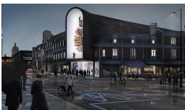
A shortlisted design for the Museum of London

The Museum of London has published the shortlisted designs for its move to Smithfield Market . The museum has also announced it is interested in creating the capital's highest viewing gallery in Eric Parry's City skyscraper at Number 1, Undershaft bd.