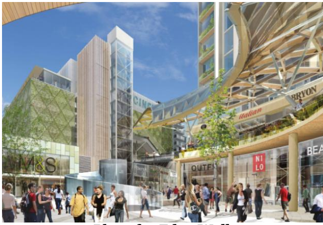
Plans for Eden Walk

Kingston council has given the go ahead for the mixed-use regeneration of the Eden Walk Shopping Centre in central Kingston, with 380 homes, office space, a new shopping centre, cinema, car parking and public spaces