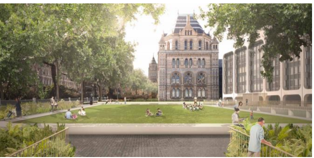
Natural History Museum plans

Biodiversity... Horticultural Week reports that London's green roof space has more than doubled over the past three years to 500,000 sq metres. Audits of the capital's Business Improvement Districts identified future scope for 300 rain gardens, 200 green walls and more than 100 hectares of green roofs, as well as smaller features such as planters and window boxes smaller features such as planters and window boxes of herbicide sprays in parks and open spaces. It is pioneering trials of chemical-free weedkillers for the Natural History Museum's grounds in London could cause the destruction of the Museum's 21-year old wildlife garden, which will be replaced with the more formal 'Western Grounds'