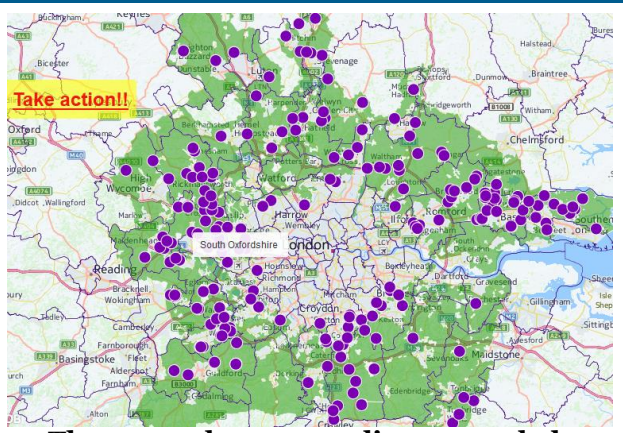
Threats to the metropolitan green belt

New map. CPRE London has published an interactive map showing nearly 200 threatened sites within the metropolitan green belt. It is calling for campaigners to lobby their MPs, who should warn ministers that there is a clear mismatch between the government's commitment to protect the green belt and the impact of its policies on the ground REFET.