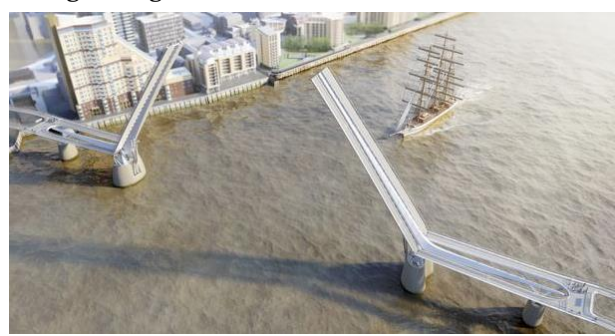
Plans for the Rotherhithe Bridge

Other crossings. Sadiq Khan has given his full backing to plans for a cycle and walking bridge linking Rotherhithe and Canary Wharf Wall. Infrastructure Intelligence looked at the proposals and feasibility of crossings along the Thames II.