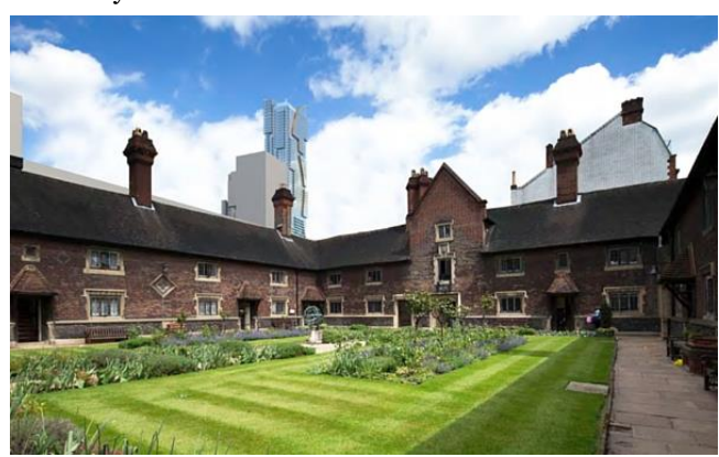
Rejected plans for One Lansdowne, Croydon