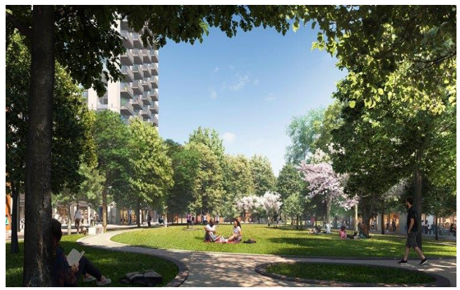
Plans for Wood Wharf

Tower Hamlets . When the borough council moves out of the current town hall in four years' time, the building will be converted into apartments under permitted development rights bd . An architect is criticising the designs for an extension to the V&A Museum of Childhood in Bethnal Green . The new South Dock footbridge in Canary Wharf has gained funding Ad. The Canary Wharf Group has announced plans for Wood Wharf. It will have 3,600 homes, one quarter affordable. The nine-hectare development will include parks, a GP practice and a school