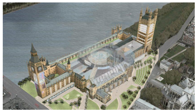
Axion Architects plans

Westminster. Historic England called for the council to reject proposals for 29-43 Oxford Street and 16-19 Soho Square saying they were the antithesis of everything that gave the area its special qualities bd. Foster & Partners has submitted proposals for an 83-room hotel, new homes, shops and restaurants on Grafton Street, Mayfair bd. Axion Architects is the latest company to propose a radical overall for the Palace of Westminster. A new circular Central Assembly Hall would be flooded with natural light "making the building more collaborative than confrontational" ge.