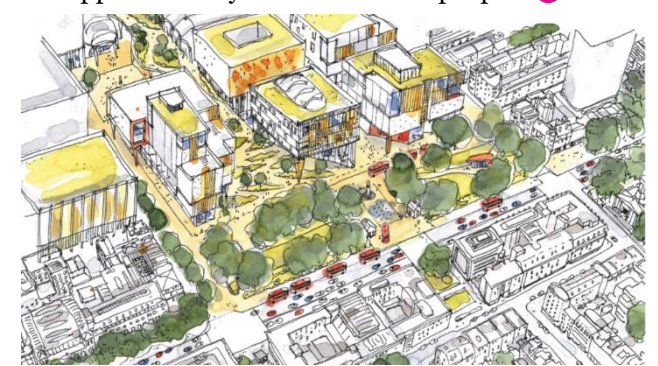
Vision for Euston by Studio Egret West