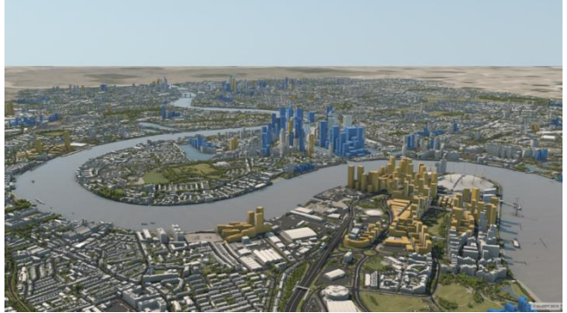
2019 Tall Buildings Pipeline Blue towers under construction, yellow planned

Tall buildings. London needs strategies to deal with the 'avalanche' of 541 towers due to come to the capital – or risk it getting 'out of control', a conference was told . The discussion came after New London Architecture launched its annual tall buildings report and declared 2019 'the year of the tall building' bd bd .