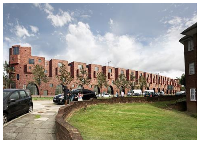
Plans for Beechwood Avenue, Barnet

Barnet council has given permission for the first housing project to take advantage of the mayor's small sites scheme bd 100.